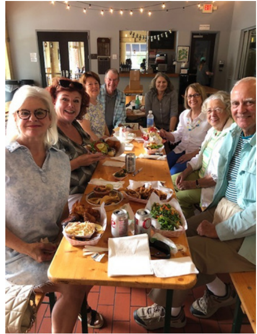
Smithtown Seafood Lunch