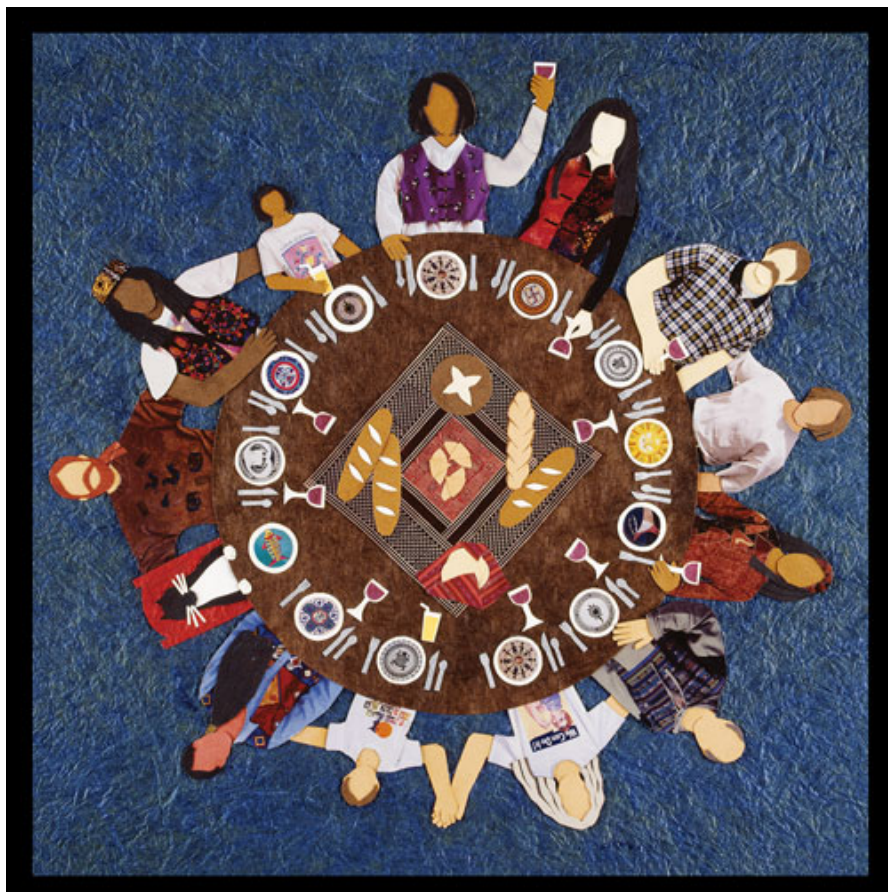
The Best Supper