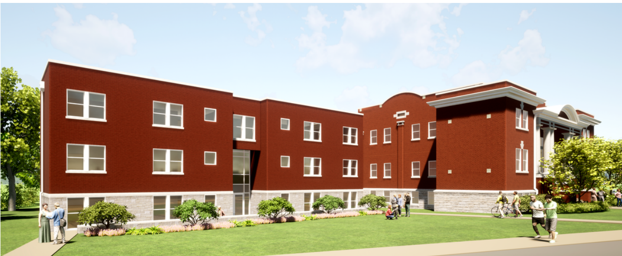
Rendering of affordable senior housing addition